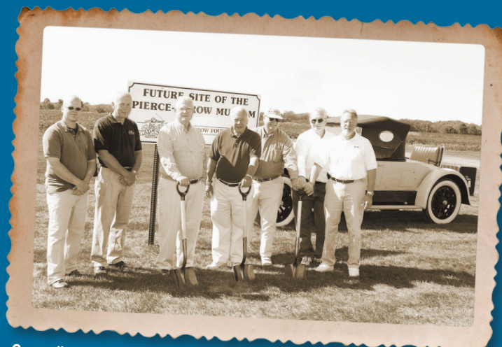
Groundbreaking of Pierce-Arrow Museum at Gilmore - September 6, 2003